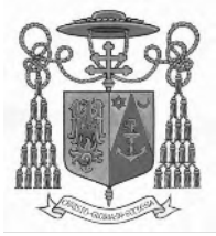
OFFICE OF THE ARCHBISHOP